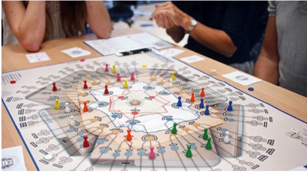
EDUCATIONAL BOARD GAME »BÜROKRATOPOLY«